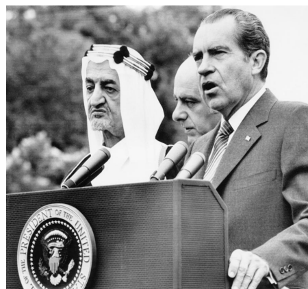
King Faisal of Saudi Arabia and Richard M. Nixon, 37th President of the United States, during a White House visit, Washington, D.C., 1971.

This publicity effort on the part of the world's Jewish community was, however, a double-edged sword: whereas it begot sympathy from many in the West, especially among Christians whose holy shrines, contrary to the wishes of the United Nations by the way, were now under the protection of the Israeli state, it triggered the ire of many in the Muslim East who understood well that might was being used to justify wrong , and that the victims of theft and aggression were now being portrayed as villainous terrorists.