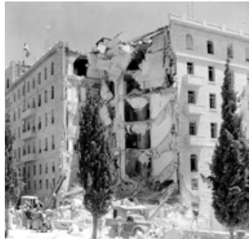
The bombing of the Kind David Hotel, 22 July 1946. The building's southern wing housed the headquarters of the British headquarters of Palestine.

Finding leaders for the pending carnage must have been easy, for the newly acquired promise land would have to be, once secured, fiercely guarded. There would be nothing better able to fulfill this task than a standing military headed by the very same who would lead the charge against the local population -- in short, the creation of a Jewish state. The unifying forces that would bring it altogether were, of course, an ancient history, a feeling of shared alienation, the creation of a national language that heretofore had been spoken only by religious clerics and a handful of Jewish linguists and historians, the promise of free land, and last, but not least, ample funding from the wealthy Zionists who had long sought possession of a Jewish homeland they could call their own.