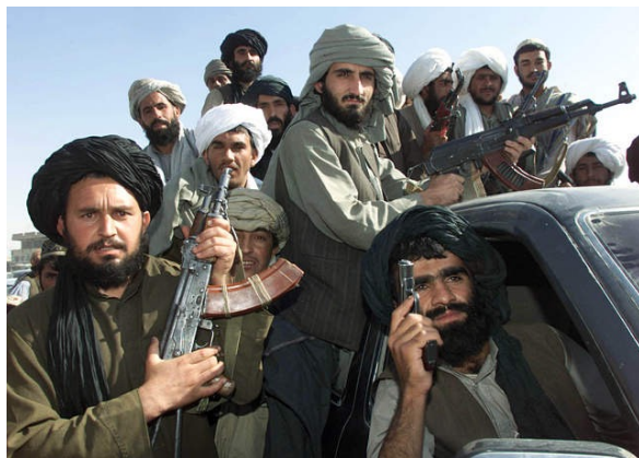
The Taliban - An Islamic fundamentalist political movement founded in 1994 in Afghanistan.

Fearful of the autocratic regimes under which they lived and disappointed by these regimes' indifference and self-indulgence toward continued Western rule, wealthy private actors in the Muslim Arabic community readily supported Muslim devotees who were willing to sacrifice life, limb, and urban comfort to stand up against continued Western support and domination. The question of Palestine, though on-going and seminal, was no longer the principal issue, for it was now clear to many that the imperial hand of Western aggression was not unique to Israel and that the people of the several Arab states who once fought to free themselves from their colonial upbringing were still in the throes of Western colonial imperialism.