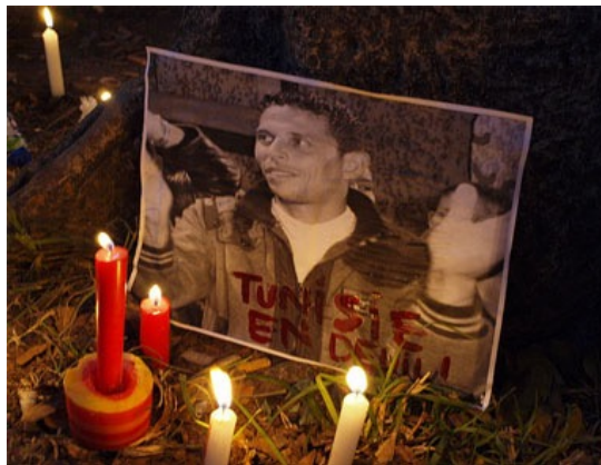
Mohamed Bouazizi (1984-2011) A Tunisian street vendor who set himself on fire and triggered the Arab Spring.

Syria was only one of many Arab countries whose citizenry were swept up by the movement. Unfortunately, Bashar al Assad, who assumed power when his father past away a decade prior, was not well prepared for his position as Syrian leader. Times had changed, and Bashar al Assad took his council from the already sclerosed bureaucracy put into place by his father. This is unfortunate, because a more politically astute leader was needed to bring about the citizen-friendly response needed to quell the largely peaceful and very popular protest that formed the basis of the movement. Seemingly unmindful of the arms, munitions, and rebellious spirit that had poured into his country