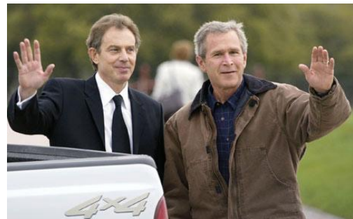
Tony Blair, British Prime Minister, with President George W Bush at his ranch. 30 November 2009.

Indeed, family and community are generally quite capable of handling most everything else, and it is surely in the family and local community where most everything else should be decided. Furthermore, these kinds of necessary close relationships have a much better chance of developing in the close-knit social bonding of comrades-in-arms than in the estranged