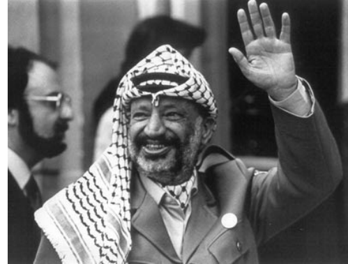
Yasser Arafat (1929-2004). Founder of Al-Fatah in 1954. In 1969 he became the Chariman of the Palestinian Liberation Organization (PLO).

What forced Arafat's hand appears to have been the indifference with which the governments of many Arab states viewed the Palestinian plight and struggle, as well as the steadfast support that Israel was receiving from Western governments. This indifference and steadfast support appear largely to have been the work of the US government who, on the one hand, traded guns and butter for oil and GCC support of the petrodollar , and on the other hand, blatantly disregarded world opinion on the matter of Palestine and repeatedly, if not openly, then tacitly, sided with Israeli aggression. In addition, there were the humiliating defeats at the hands of the Israelis that the Arab governments of the region had been forced to endure, and that they would sooner forget than risk again.