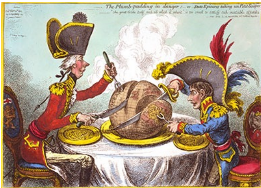
America gone astray.

Ironically, the result of this imperial struggle has been one of political and economic convergence, Whereas the Russians, Chinese,