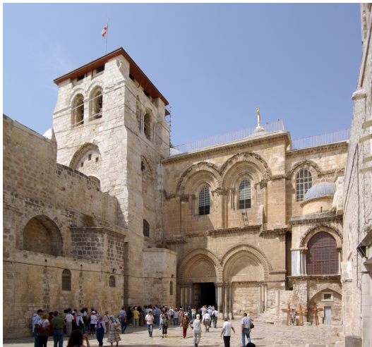
Church of the Holy Sepulcher, Jerusalem.

For many hundreds of years Muslim, Jewish, and Christian Semites have populated the region in near total harmony. Before the formation of the state of Israel the language of the local Jewish inhabitants was a dialect of Arabic. Now, the Ottoman empire may not