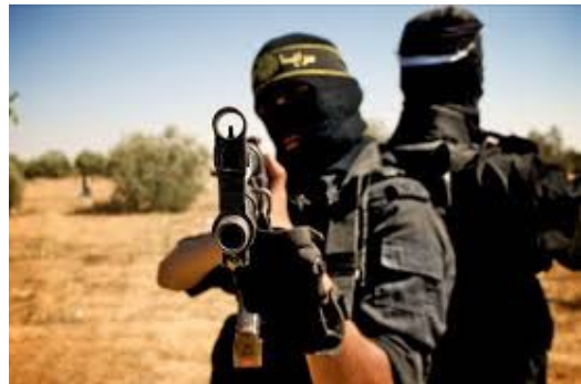
The Islamic State of Iraq and Svria (ISIS)

Firstly, our aggressive intervention in the region is well-documented. Secondly, the world press, like our own national press, is highly biased and reports only what serves to mollify the Western public into purchasing the products of their corporate sponsors. In effect, most of us have no way of knowing whether what is reported is true or not. What is more, even if everything that is reported were true, what about all of that which is not reported? Thirdly, is it not presumptuous to believe that our own governments are so much different than all the other governments of the world? Is it not reasonable to assume that the same welded interests of profit-hungry crony-capitalists, racketeering government bureaucracies, and self-aggrandizing national politicians are operative in every country? Have we not sufficient proof of this already in the aftermath of the invasion of Iraq? And finally, who are we, or you, to believe that the